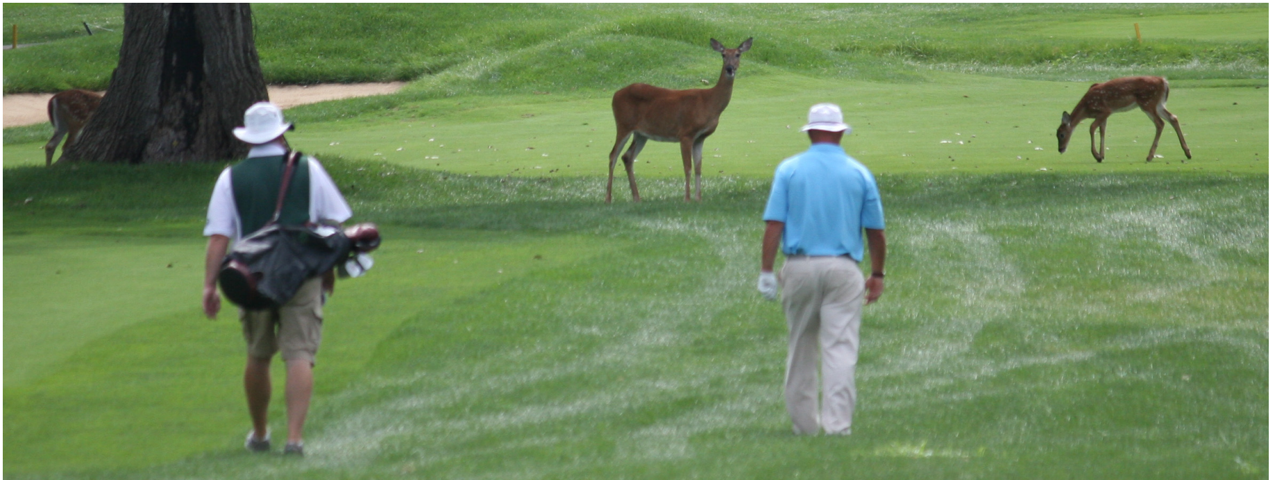
OH DEER! Nature and golf co-exist peacefully at Olympia Fields. Here, a herd of deer help manicure the 11th fairway on the South Course.