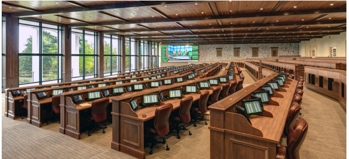
Augusta National Golf Club

Is this, then, at long last, the breakthrough for Garcia, the one that will lead to a cascade of major titles?