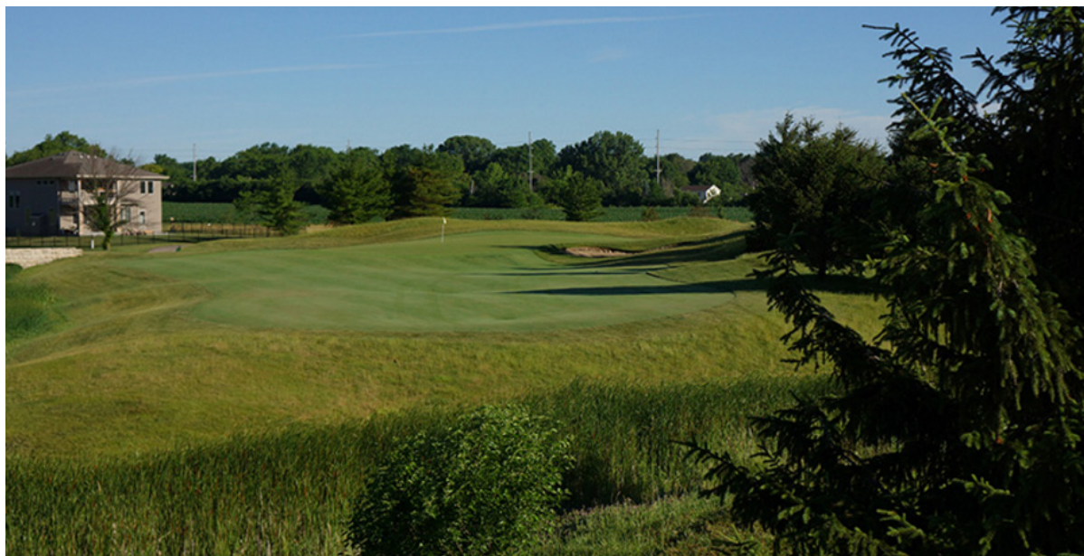
Stone Creek Golf Club

The closure leaves four public courses in Vermillion County, three in Danville and Hubbard Trail in Hoopeston.