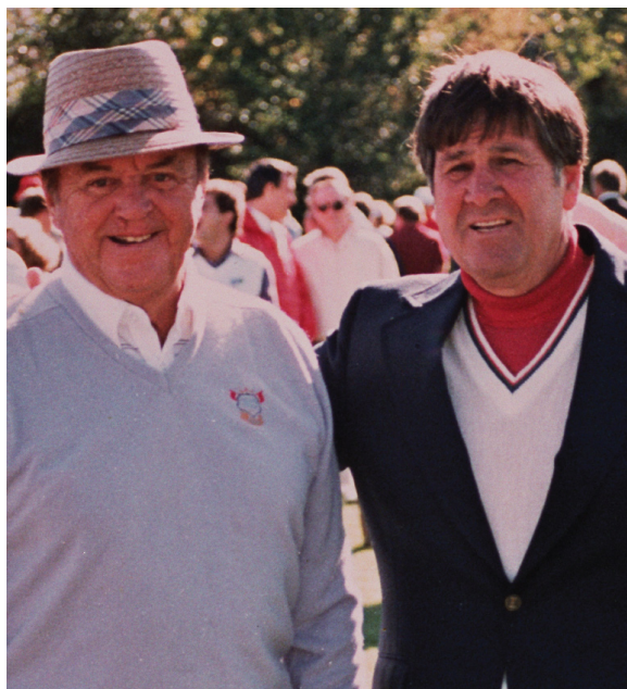
Beverly Country Club

"He's done a masterful job of navigating himself through the maze of problems that any pro-