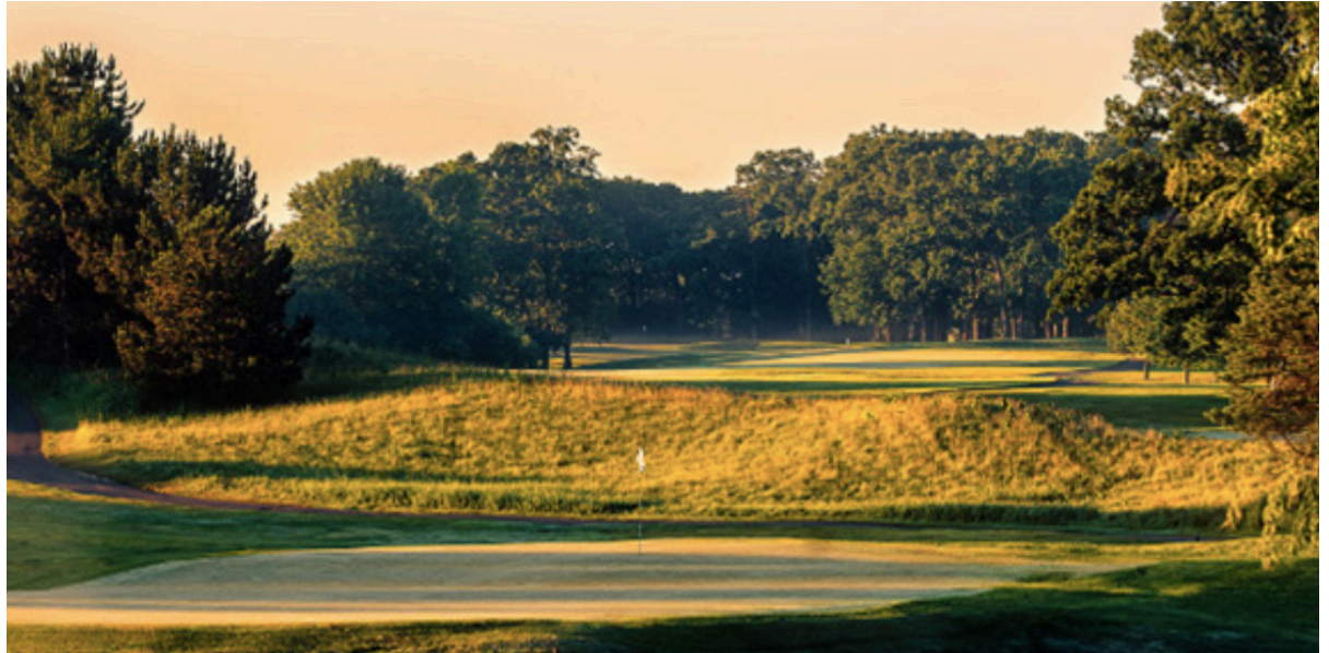
Stonewall Orchard Golf Club