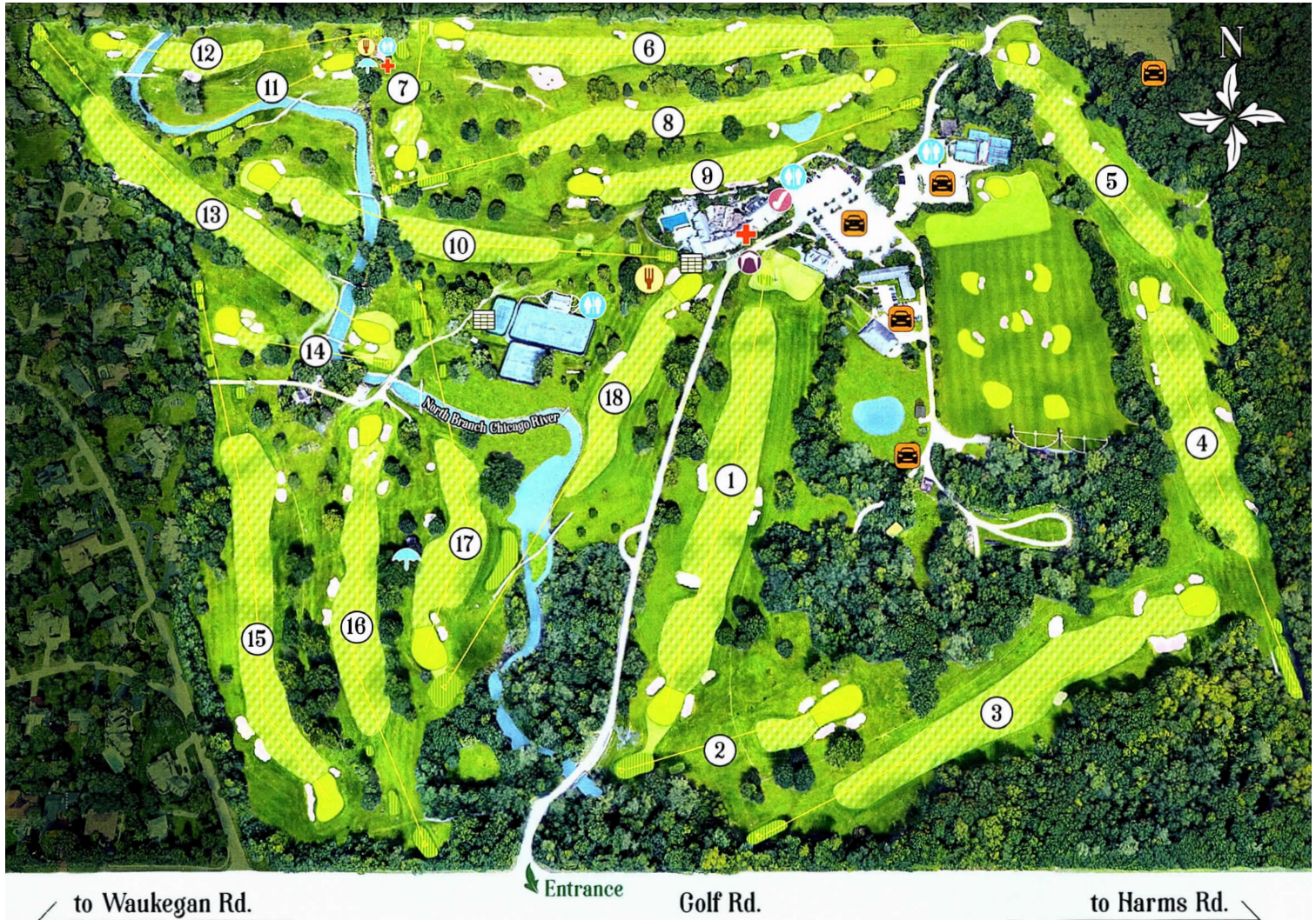
Glen View Club