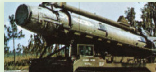
The Pershing 1