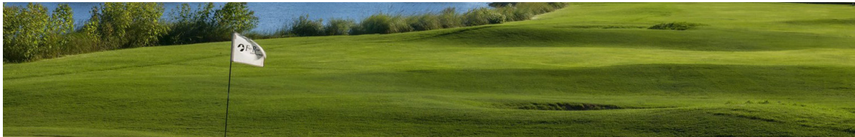
Fox Run Golf Links

NEW HOME Fox Run Golf Links, seen here in summer dress, recently opened a new clubhouse.