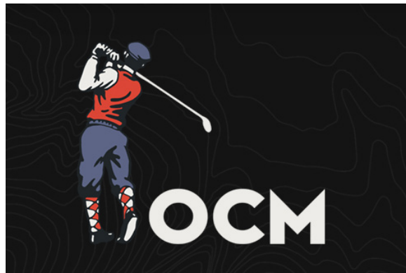
Ogilvy, Cocking and Mead

Of the $23.5 million price tag, checks will be written to cover $18.5 million, or a little over $1 million a hole. The other $5 million is the lost